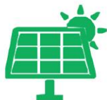
Energy Storage System